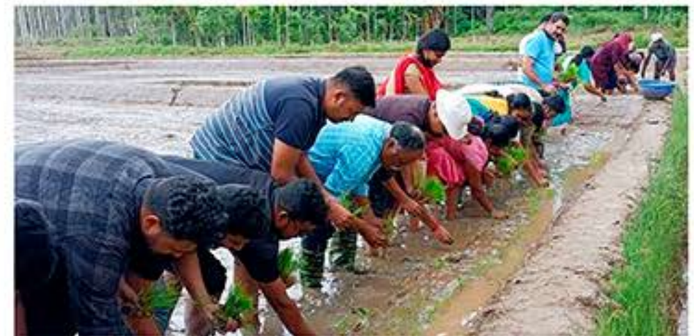
Unique story of our college. Hopefully, to reap a great harvest: the entire team of Nilgiri College is participating in paddy cultivation.

be yielded. The project was being initially launched during the period of COVID-19 pandemic. The students, staff, faculties and neighbours have actively supported the same. All barren places across the campus were fruitfully used for various seasonal crops, vegetable farming and banana plantation. The yield from crops is being used as rice at the college canteen and delivered as gift packs to the community too. While getting back into offline classes we were getting into the field to reap a great harvest.